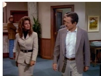
The interior of the new Tuscany Interstate Bank set that had to be built on short notice: scenes from episodes 187 <8.04> and 189 <8.06>.

The left screen capture shows the tellers' desk and the access to the vault. The right one shows the entrance to the bank manager's office (behind Pilar's desk).