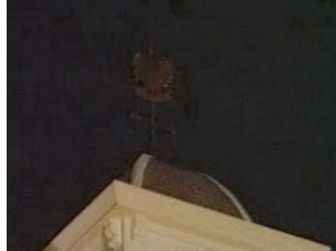
Left: The coat of arms on the cupola of the main tower replica.

Attached is a photo of the 50-foot-high section of the Mansion we built on the backlot especially for the fire scene. You can see the Falcon Crest coat of arms weathervane on the top of the cupola. It was custom built for that set.