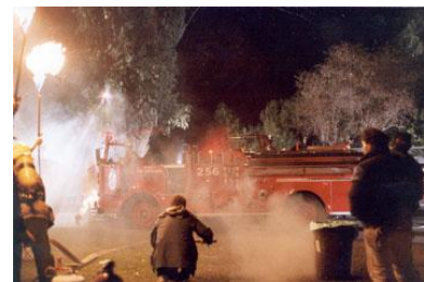
Right: A picture from the CBS backlot taken while they filmed the fire scene.

We have floor plans of the bank set you mentioned in your original reply but would be very curious to see the winery set floor plan — if you may still have them.