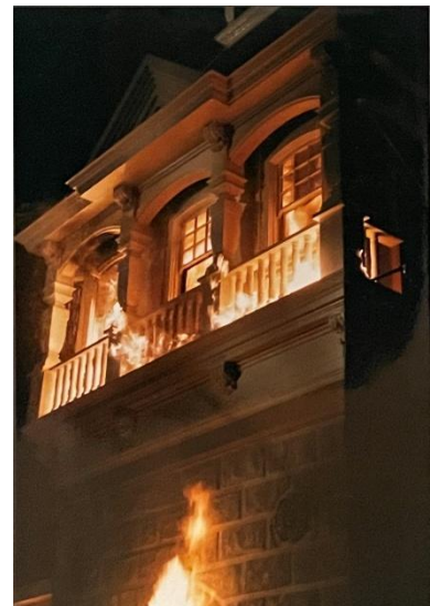
Right: The burning replica of the main tower. Note the gas pipes behind the balustrade to create the fire.