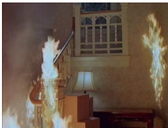
Left and above: Scenes from episode 186 <8.03> with the burning set of the Falcon Crest Victorian Mansion : The existing set was used to create the fire and was reused in later episodes.