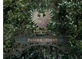
Right: The coat of arm on the main gate to Falcon Crest .