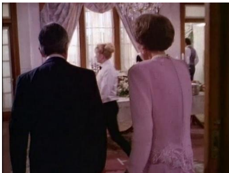
In a scene from episode 191 <8.08> the interior set of the glass covered patio or conservatory was "used": A waiter entered the patio (seen on the right).

Sometimes things like that are an inexpensive way to get extra depth in the foreground set or are used to "break up" a painted backing. As far as your comment about spending the money on a room and then never using it — in an episodic show such as this, the "standing sets" are typically all built at the beginning of the season so that the cost of them can be amortized over the entire season. The list of sets that are asked for by the producers are their best guess for what will be needed in the future.