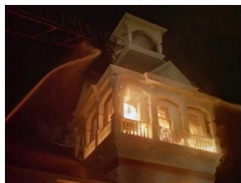
Center: The main tower engulfed in flames.