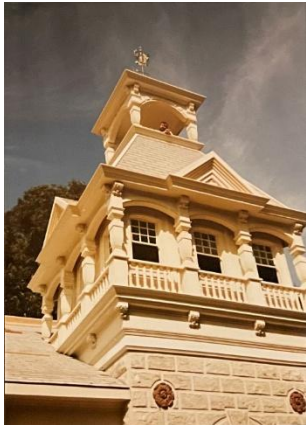
The main tower replica of the Falcon Crest Victorian Mansion built on the CBS backlot.

Was the coat of arms on top of the exterior set of the Victorian Mansion that was specifically built for the fire scene the same prop as the one used on the main gate to Falcon Crest ?