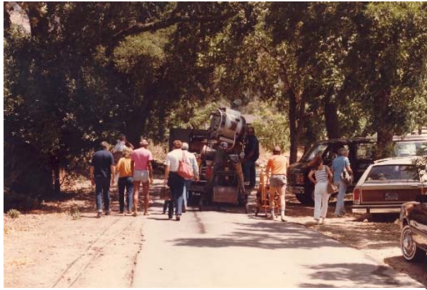
Preparations for filming episode 49 at Stags' Leap , which posed as the Gioberti Estate .

"I just finished working on additional photography for a show that was pre - pandemic, which just came back to finish. It was a Western — I always wanted to work on a Western — it's called The Outlaw Johnny Black and it's starring Michael Jai White, who is a famous martial artist and who starred in many movies and directed a few. It was great to be back and working. And luckily for me, because it was a Western, it was all outside. We were on a movie ranch where they used to film Little House on the Prairie . It was not urban; it was on a ranch called Big Sky . We were there and we were on the backlot outside at Universal . And I have some things in the works but it's very jinxing to mention them."