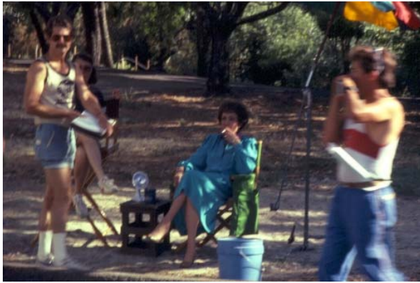
Jane Wyman smoking a cigarette near the winery during a break from filming episode 52 at Spring Mountain .