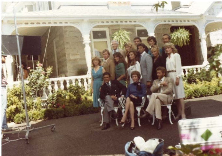
The official season 3 cast group photo being taken on the driveway of Spring Mountain's Villa Miravalle.