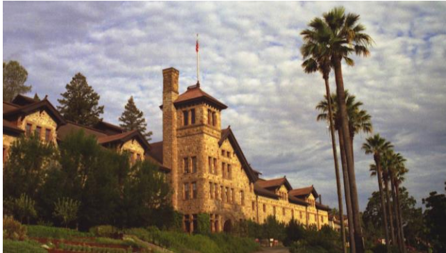
A 1997 photo of the old Christian Brothers Winery .

“The Christian Brothers Winery was never used... though one local winery was used, but I forget which one. They needed some interior wine scenes,” he added.