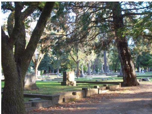
A 2007 view of the burial site: Not much has changed at the St. Helena Public Cemetery since the filming of Falcon Crest took place.